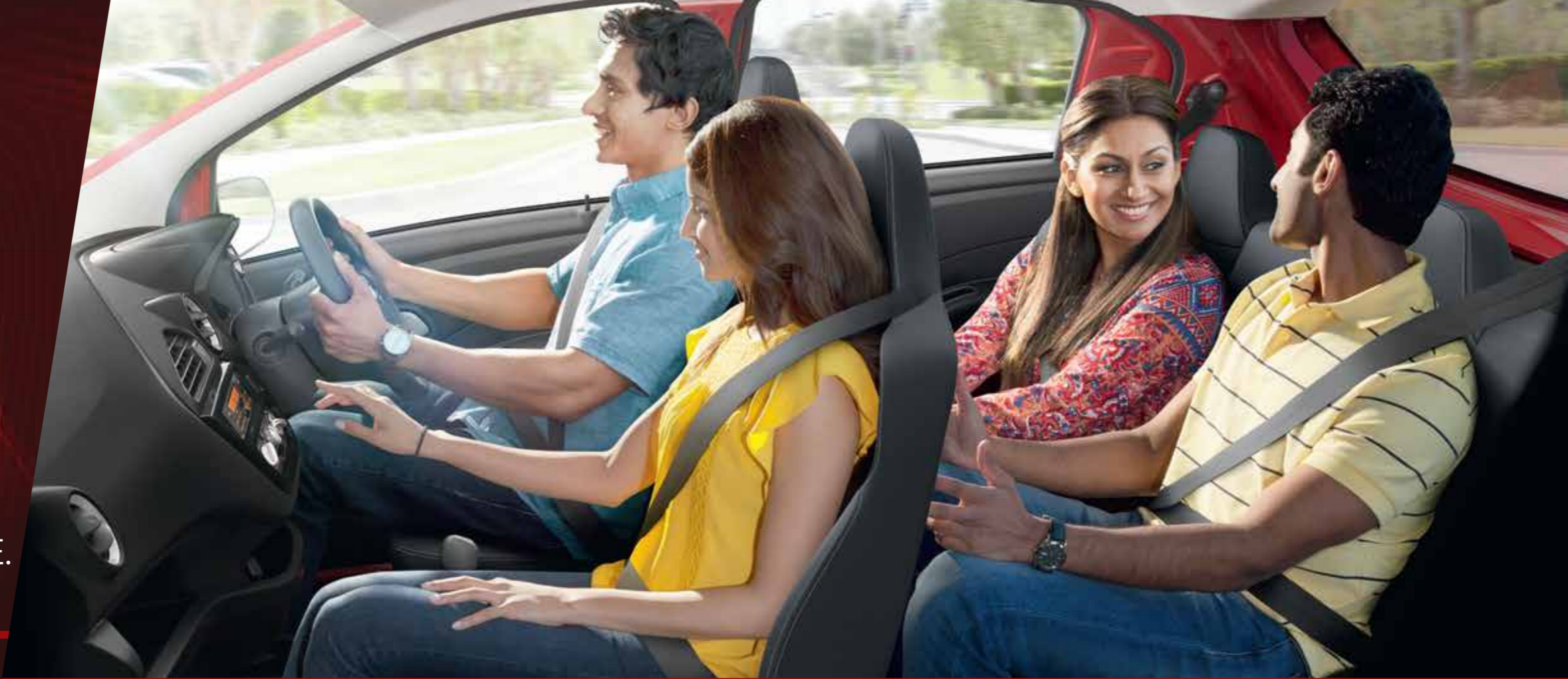
Tallboy Design with Superior Headroom

India has changed. So, have your expectations from your car. And that is why we have designed the Datsun redi-GO with Japanese engineering to give you more: more space, more comfort, more power. Datsun redi-GO. It is the car designed for you.