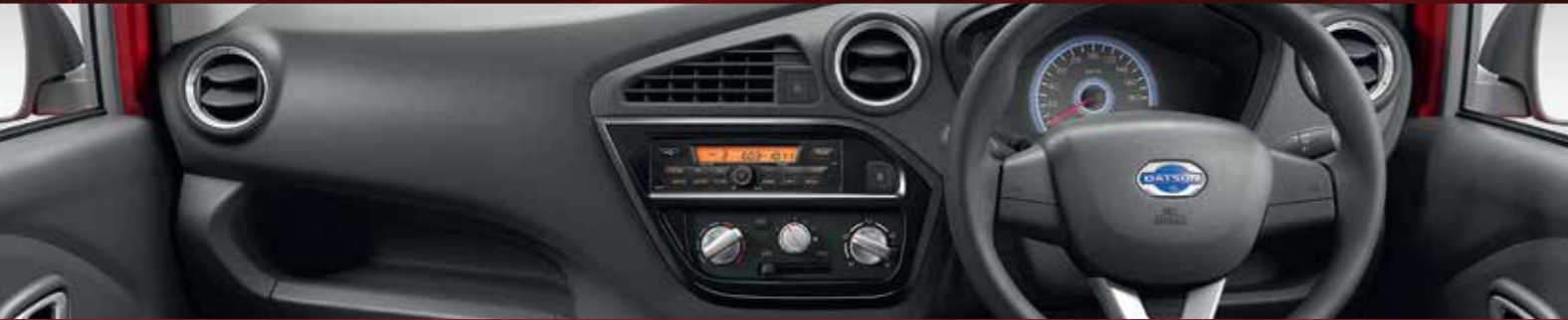
All Black Premium Interiors and Bluetooth Audio with Hands-free Calling

From uber premium interiors to bold exterior style, the Datsun redi-GO has it all. Every interior detail has been designed to notch up your style quotient.