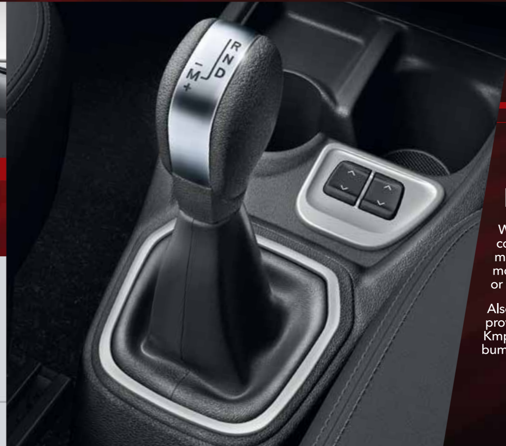
Smart Drive Auto